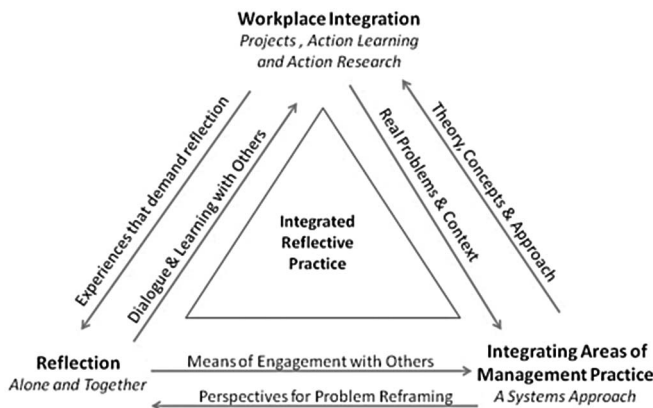
FIGURE 2 The relationship between IRP and M.S. DIM pedagogy [13].

provides a foundation for true lifelong learning. Reflective, or double-loop learning leads to improved performance and new knowledge about practice [18].